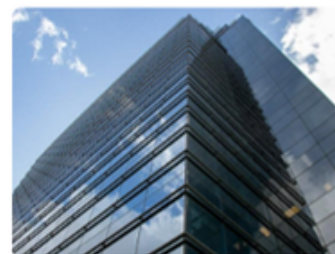
Alem Alem 882 (2.º floor)