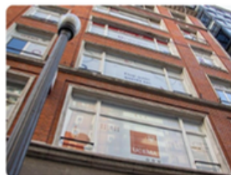
Florida Av. Córdoba 637