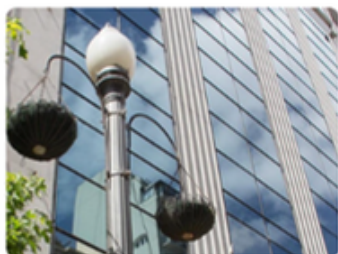
Córdoba - Main Building Av. Córdoba 374

The university currently operates four campuses, all within walking distance of one another.